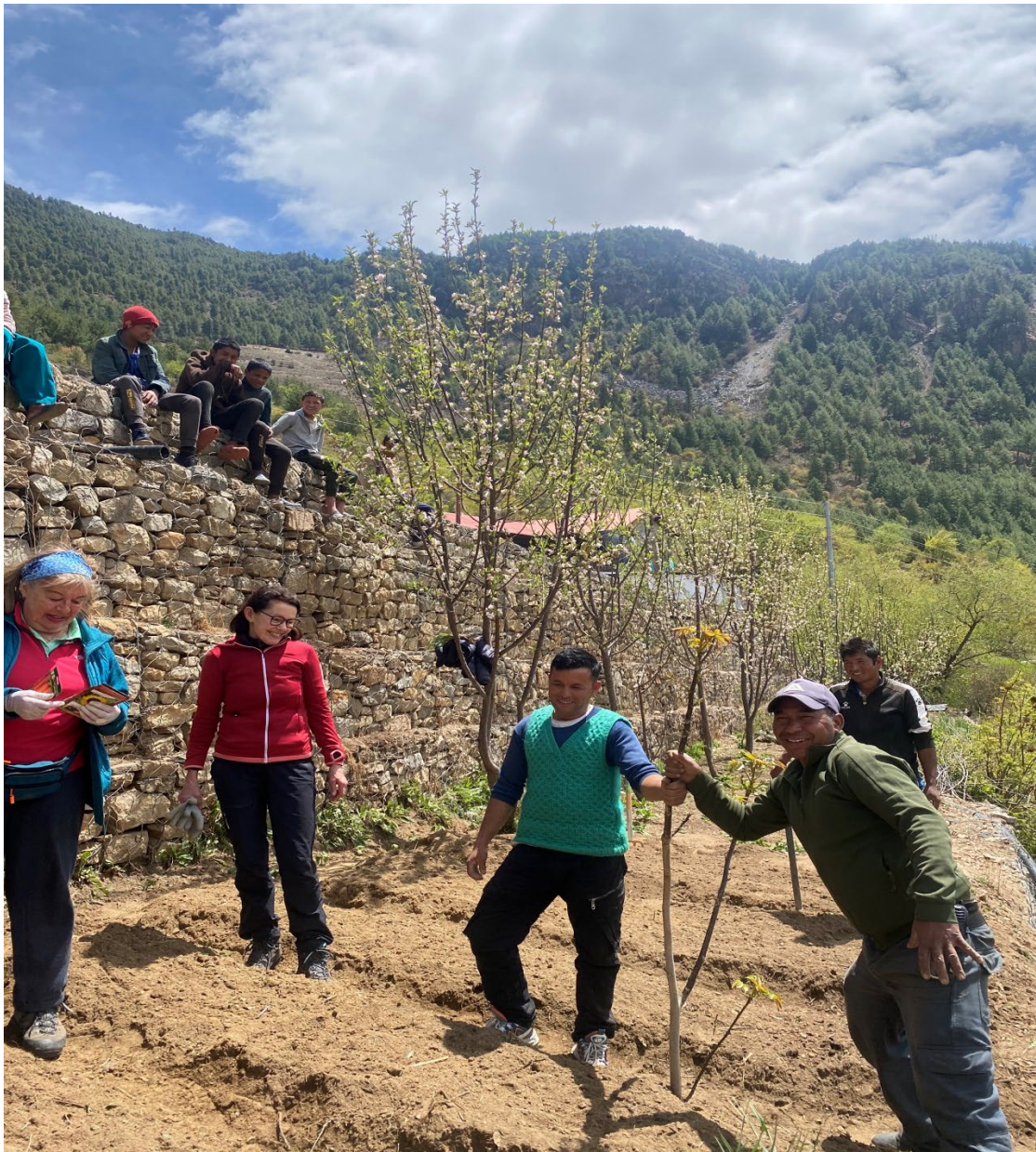
Working in garden... dug field, made rows for different vegetables..... planted cucumber, carrot, pumpkin.....